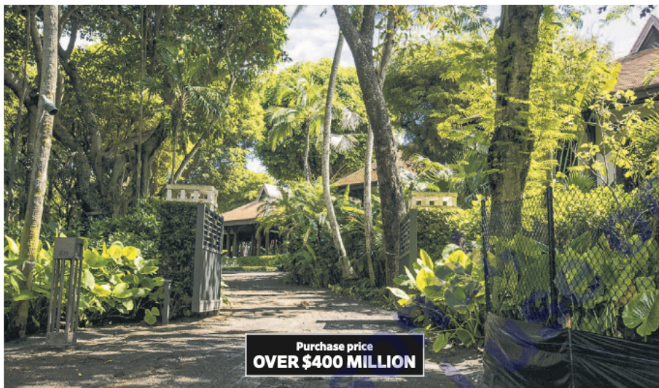
Since 2012, Griffin has purchased multiple properties in Palm Beach, assembling an oceanfront compound.

values if the seven lots had sold at those same prices to different individuals, rather than just one wealthy guy, Jansheski said.