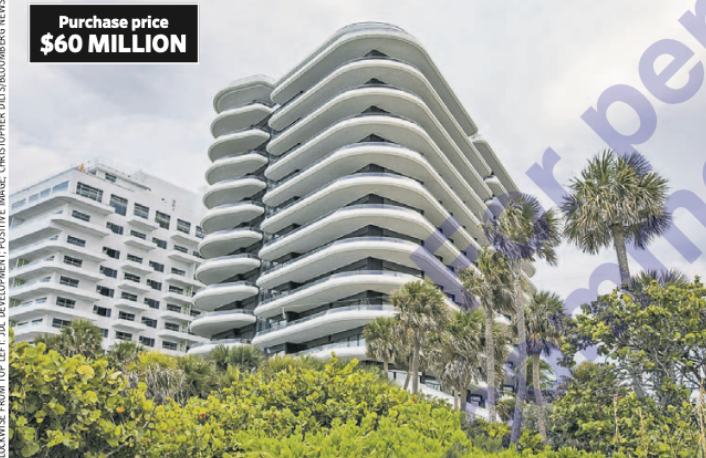
In 2015, Griffin set a price record in Miami when he bought two penthouses at Faena House

Quitting smoking was hard. Screening for lung cancer is easy.