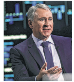
Griffin set a record for Chicago in 2017 with his purchase of four units in 9 Walton.